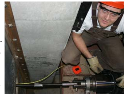
John conducting his large scale laboratory test in 2007.

The large scale buried infrastructure test facility at Queen's permits experimental studies under known geotechnical and construction conditions. John employed digital photographs and analysis using Particle Image Velocimetry, and the lab's servo-controlled total station, to determine patterns of surface movement throughout the tests. These results are being used by PhD student Kazi Rahman to develop 3D finite element models of bursting using ABAQUS.